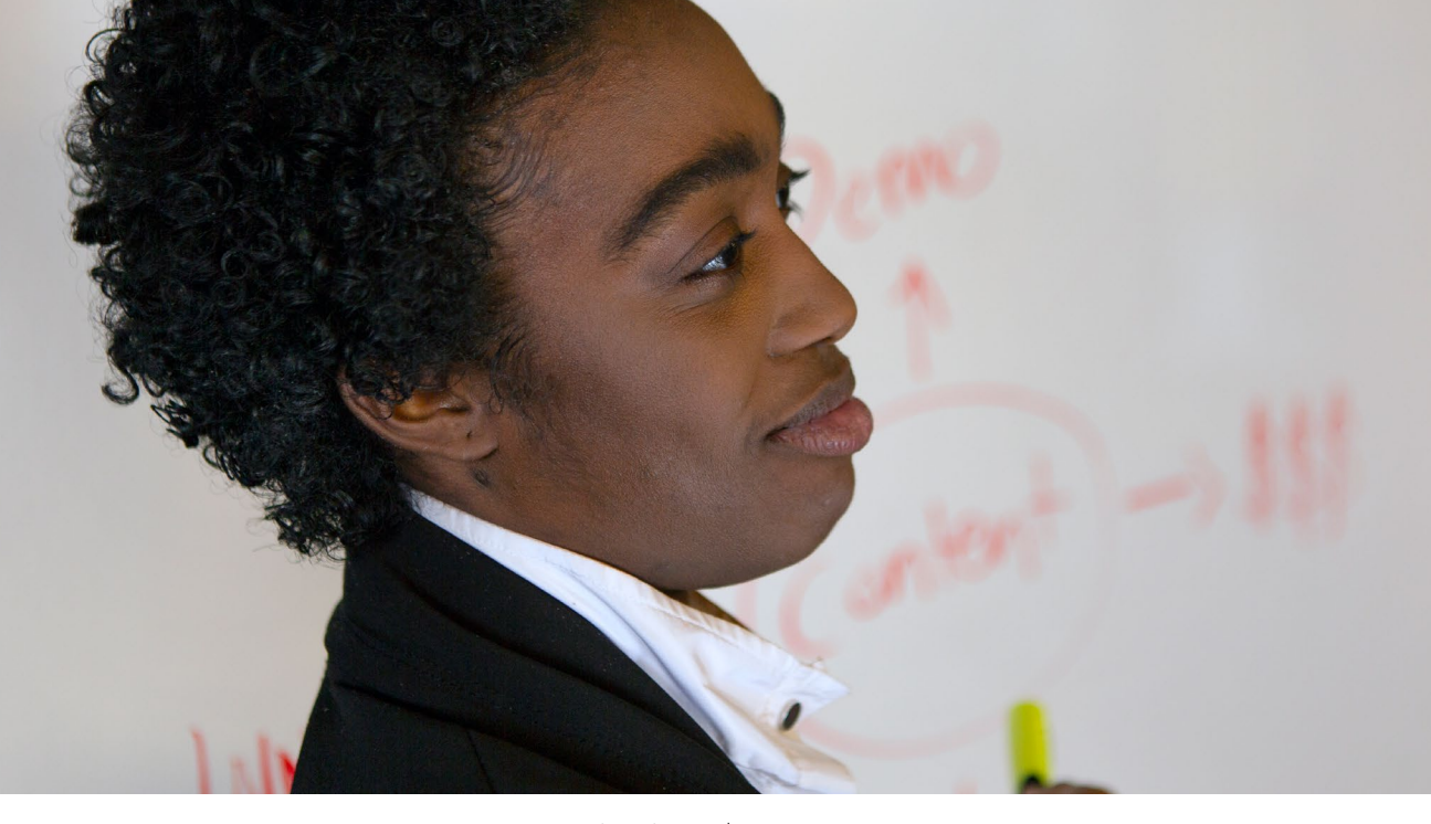
This Photo is a part of The Gender Spectrum Collection by Zackary Drucker